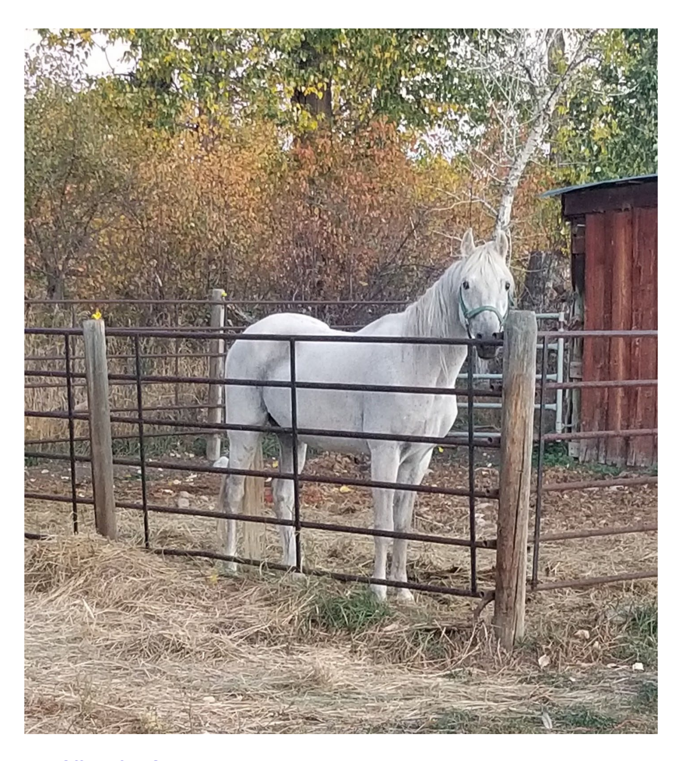
An Officer & A Gentleman was a recently acquired elegant senior stallion, grey, with excellent pedigree. We're very pleased with our first foals from him, one for us and several for clients. Stud fee is $700. [papers]