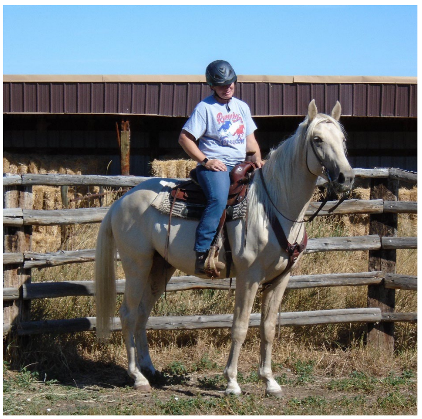
Buck's Gold Nugget (Pal) is a big, rugged palomino stallion from the last colt crop of <a href="The Buck Starts Here">The Buck Starts Here</a>, who stood for many years at the Holmes Farm in Missouri. He's a big, strapping stallion, 16 hands at age three, whose first foal (Absaroka Gold Dust) is spectacular. We now have three additional mares in foal to him for spring 2024. Stud fee is $700. [papers]